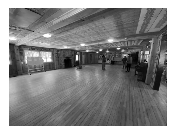
Dining Hall -- another dance space