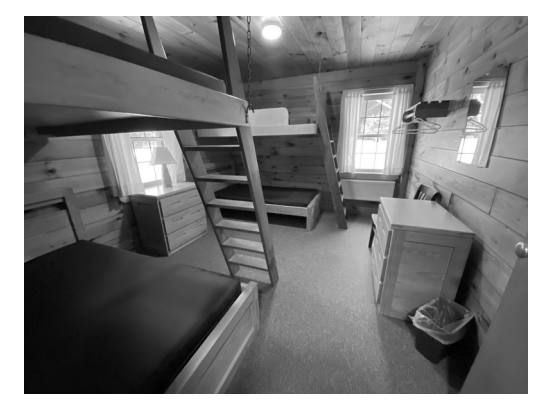
Spacious dormitory room