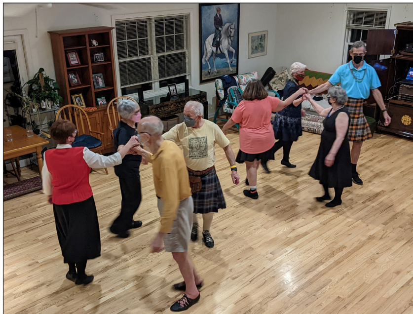
Dancers at Newbitz House