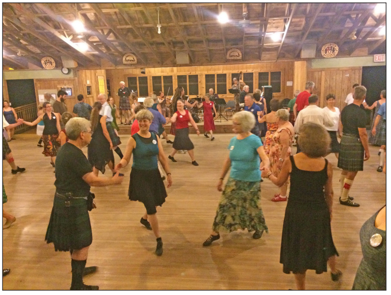
Dance Party in C#, 2016

For info and registration, go to rscdsboston.org/pinewoods-esc.html