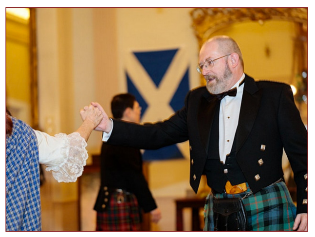
Dancers at last year's Burns Night