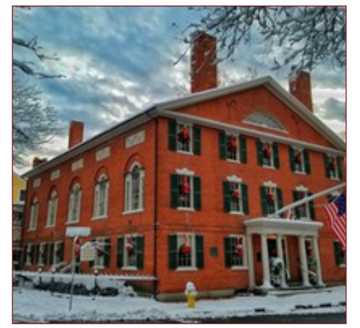
The historic Hamilton Hall, Salem, Mass. Boston Branch dancers have fond memories of many magical dance events here.

The evening begins with appetizers and whisky tasting with laid back experts where you can learn a few things. Enjoy the open bar and live Scottish music while you chat with friends, admire everyone's garb and get ready for the delicious seated three course meal, followed by Scottish dancing. To top it all off, we'll be raffling off a trip to Scotland!