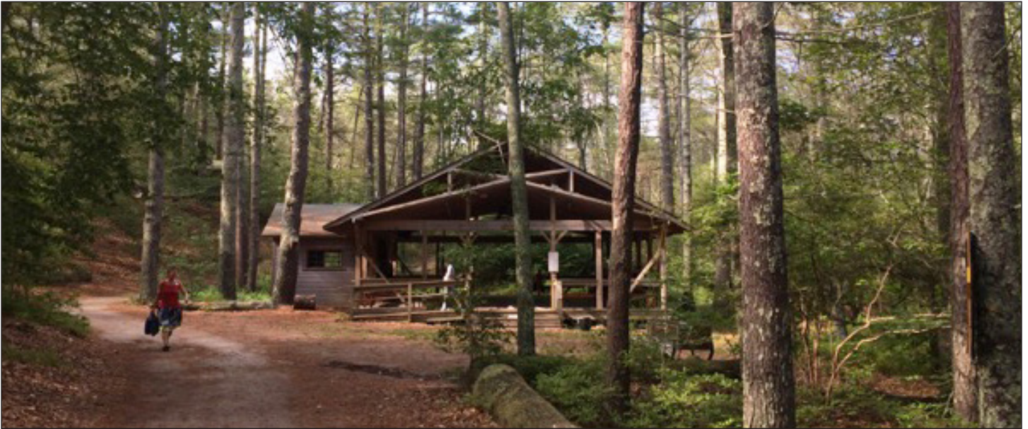
C# Minor Hall, Pinewoods Camp, Plymouth, Mass. July 2018