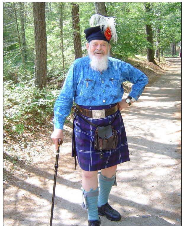
Pinewoods 2016