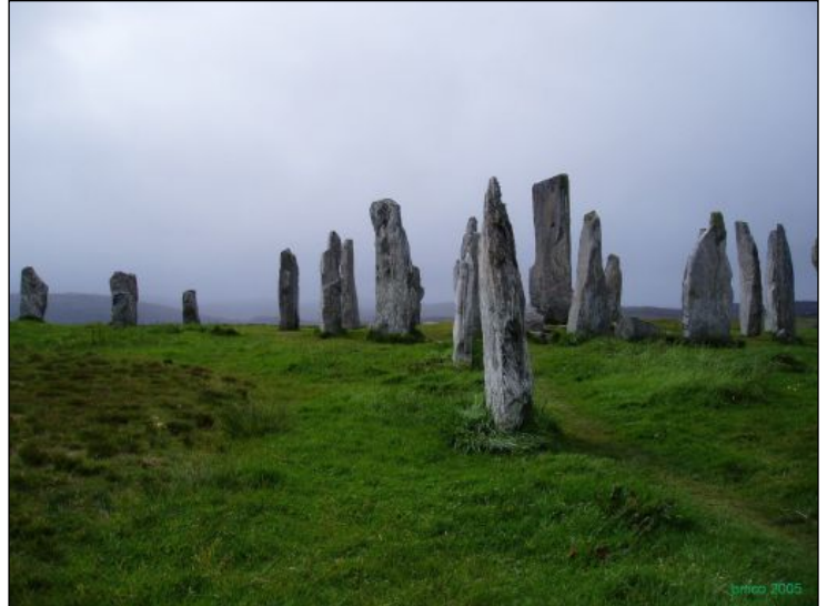
Standing Stones of Callanish, Lewis

More information may be found at www.callanishvisitorcentre.co.uk